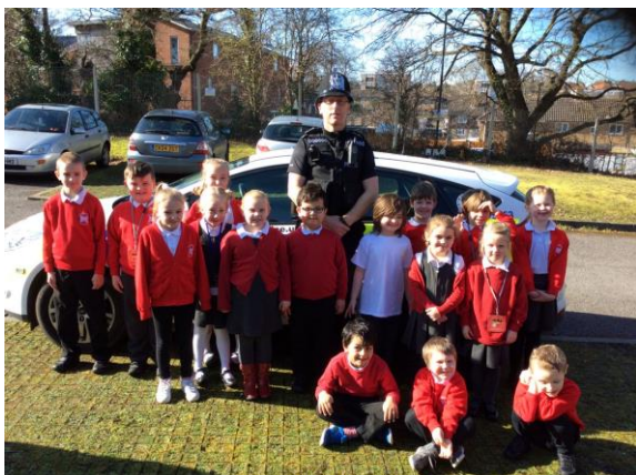
Visit to Townhill Primary School.